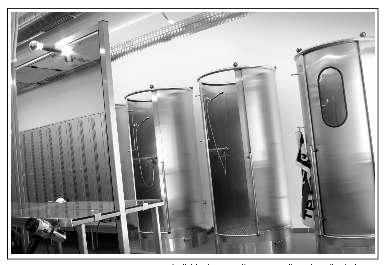
Individual connections per unit as described above